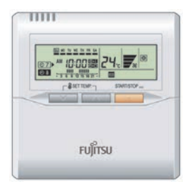
UTY-RNNYN Wired Remote Controller