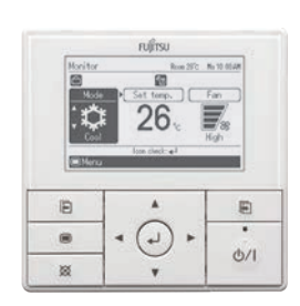
UTY-RVNYN Backlit Wired Remote Controller (High Grade)